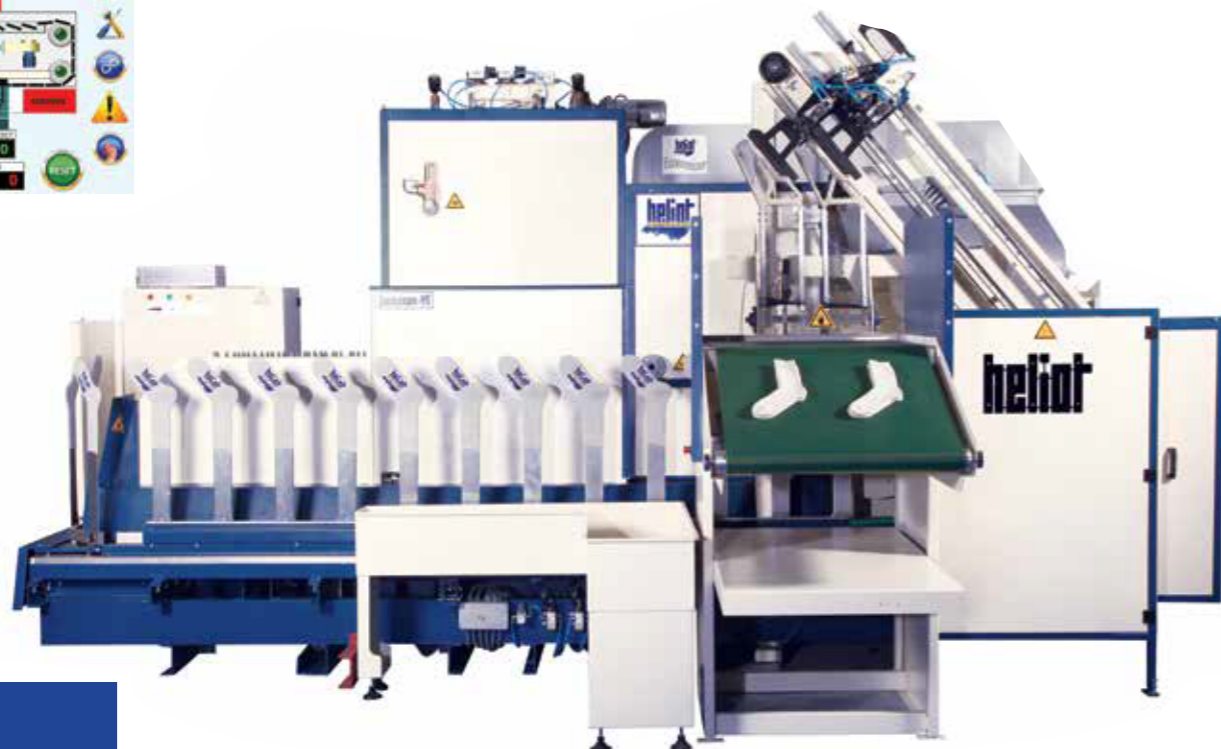
A SPEEDSTER LEGEND